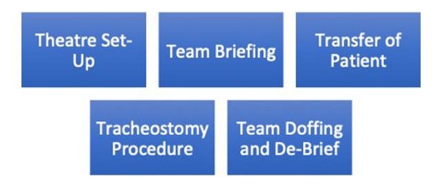
Fig. 1. The "5Ts" for a safe covid19 tracheostomy.

D. Broderick et al. / British Journal of Oral and Maxillofacial Surgery xxx (2020) xxx-xxx