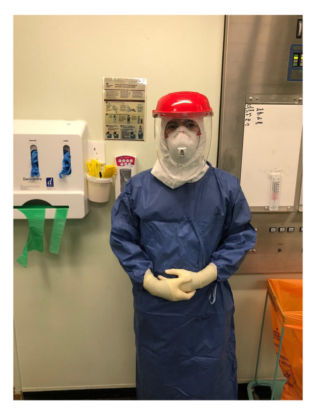
Fig. 2. PPE for a covid19 surgical tracheostomy.

Given the challenges and the complexity of surgical tracheostomies on covid19 patients, we aim to have weekly dedicated days and slots for these patients.