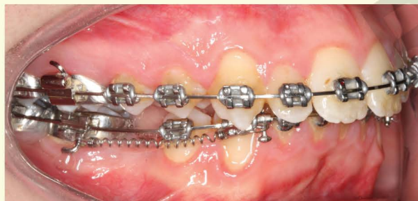
Examples of how teeth bite just before surgery.